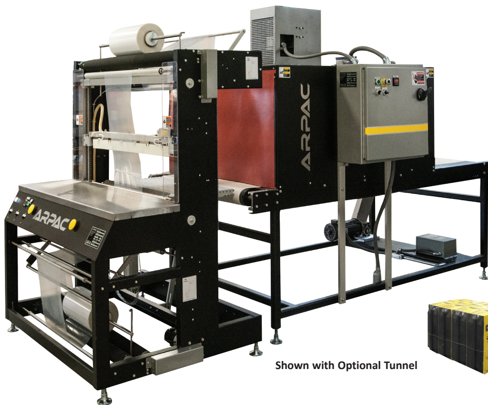
Shown with Optional Tunnel