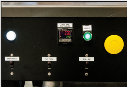
User-Friendly Operator Controls