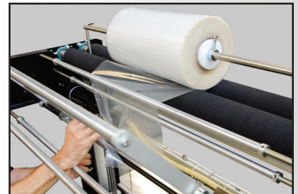
Powered Film Feed

Complete Aftermarket Service & Support for Your Packaging Equipment