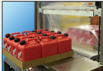
Seal Cleaning Film Cut-off