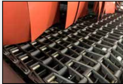
Optional Falcon Belt for LDPE Film