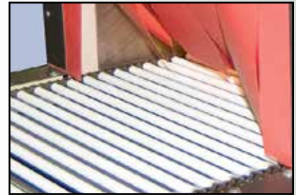
Optional Roller Belt

Complete Aftermarket Service & Support for Your Packaging Equipment