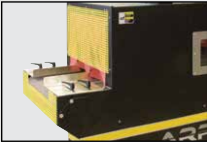
Optional Guarding Available