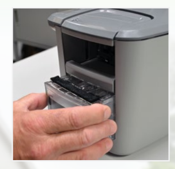
Eject and fill the water tank, then insert it back into place.