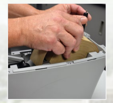
Remove cover to insert tape, then feed tape through slot.