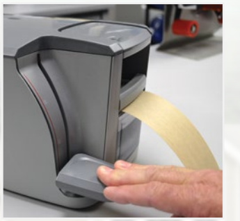
Push lever to dispense tape to desired length (Additional pushes may be required).