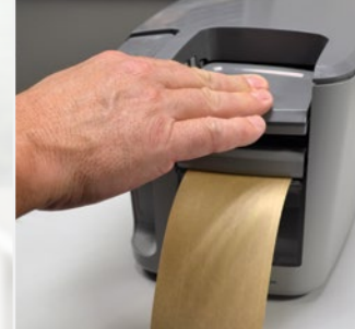
Push cutter down to cut the tape.