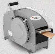
BP333 Plus with Heater