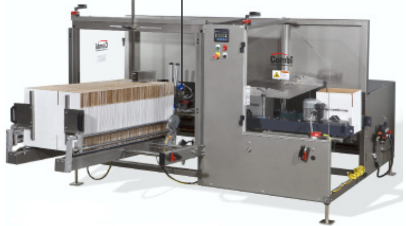
2-EZ HS CASE ERECTOR Case Erector, Bottom Sealer