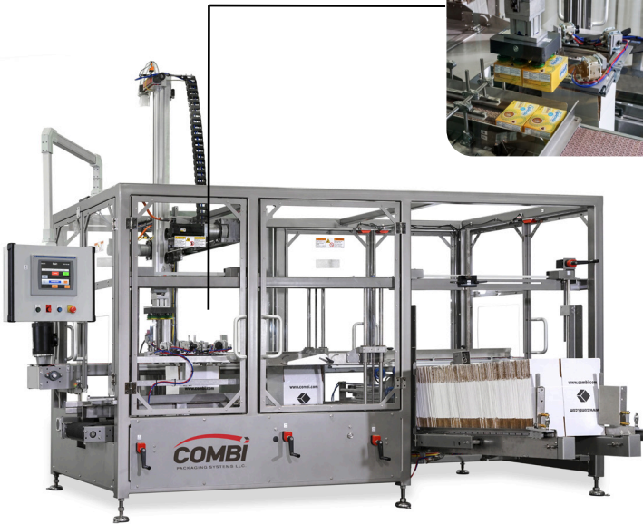
ALPHAPACK® 15/20 Integrated Case Erector and Bottom Sealer