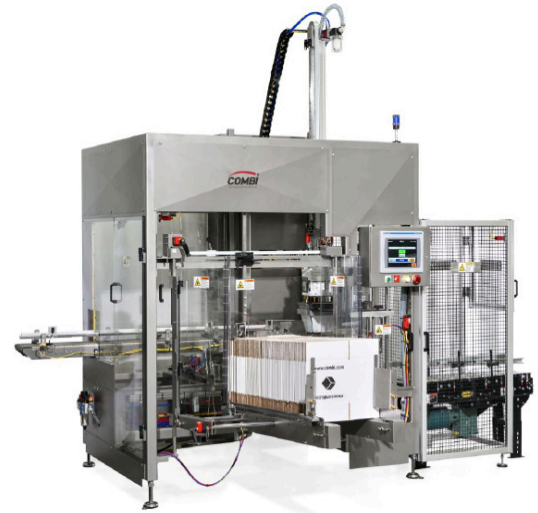
ALPHAPACK® 8/10 Integrated Case Erector