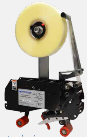
ET 2Plus tape head

When you compare features, benefits and value, Interpack™ Case Sealers are the right choice for operators, plant engineers, maintenance and purchasing.