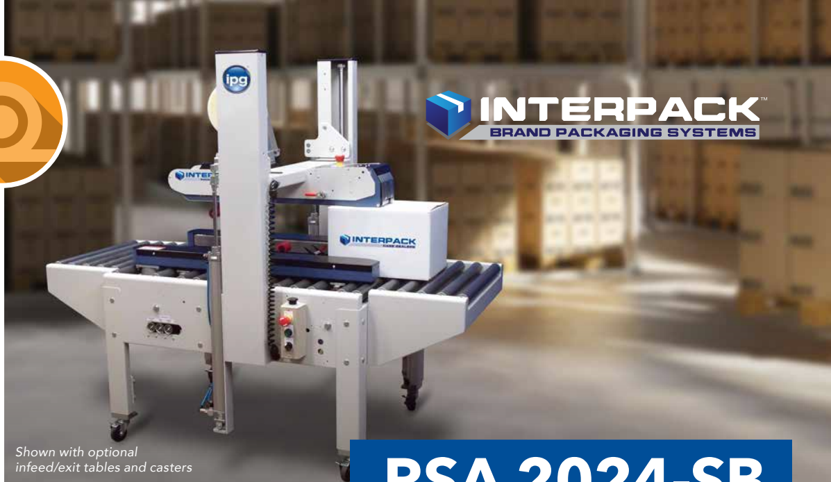
Shown with optional infeed/exit tables and casters