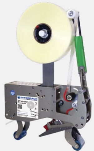
ET Xtreme™ Tape Head

Featured with the newly designed Interpack RSA case sealer is the next generation ET Xtreme™ tape head housing patented technology that safely provides optimal tape application and wipe down - even on recycled corrugate. Superior wipe down on each of the three taped panels is achieved with innovative design while minimizing force, thus, virtually eliminating crushed or damaged cases. When you compare features, benefits and value, Interpack Case Sealers are the right choice for your demanding job.