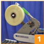
1 Tip-up tape head simplifies roll replacement