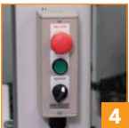
4 "Blocked" button for jams & replacing bottom tape roll