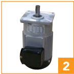
2 One 1/2 HP motor & one 1/4 HP motor