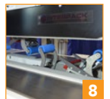
8 Offset tape heads process 2" high cases