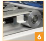
6 Self-tensioning & tracking drive belts simplify belt replacement