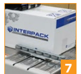
7 Horizontal centering guides with rollers