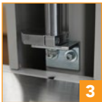
3 Selectable minimum height