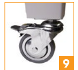
9 Optional swivel & locking casters