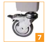
7 Optional swivel & locking casters