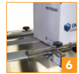
6 Horizontal self-centering infeed guides