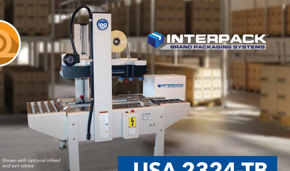
Shown with optional infeed and exit tables