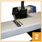
2 Single handle locks upper head to both columns