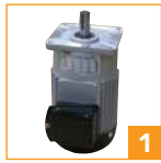
1 ½ HP lower and ¼ HP upper gear motors to process cases up to 85 lbs.