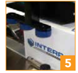
5 3-wheel top squeezer