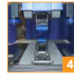
4 Top & bottom belt drive is the best system for case sealing