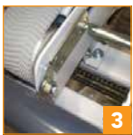
3 Self-tensioning & self tracking 3" wide drive belts