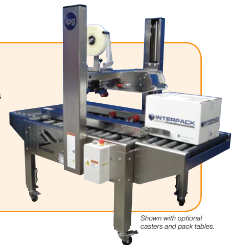
Shown with optional casters and pack tables.