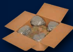
Home and Garden