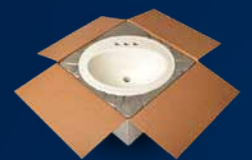
B2B and B2C