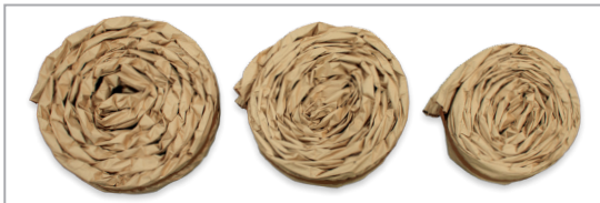
Wide range of density selections

The Auto-Coiler has a wide range of approved paper basis weight combinations to configure to heavy or extreme cushioning requirements. Additionally, you will have the control of how dense your coils are created to have an even further level of customization.