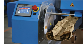
Switch from pads to coils with the touch of a button