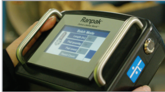
Detachable control box