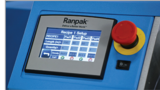
Customize detailed packaging sequences