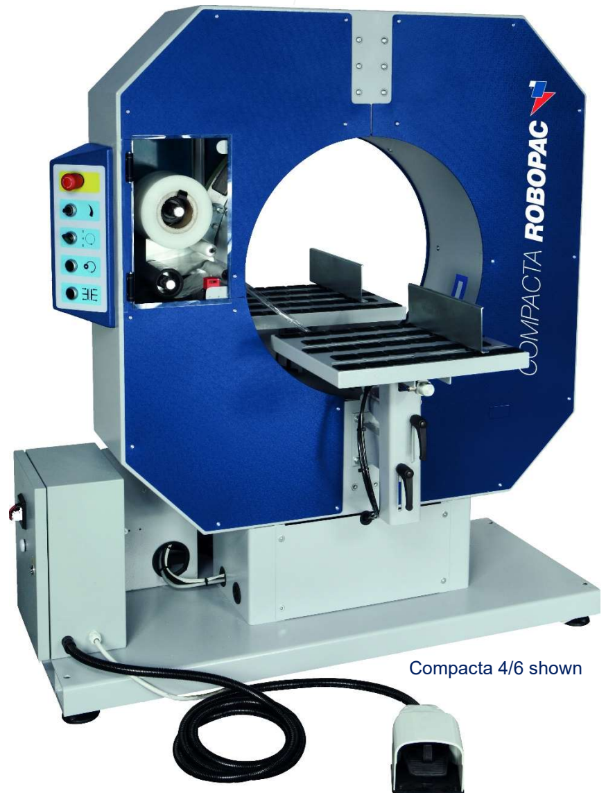
Compacta 4/6 shown

Safe, simple operation includes automatic film clamping and cutting. Compactas feature constant film tensioning to improve package integrity and reduce film breaks.