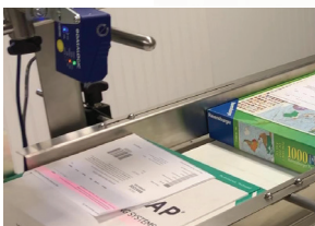
PHOTO EYE MEASUREMENT

Advanced photo eyes accurately measure the product dimensions to create the perfectly sized package every time.